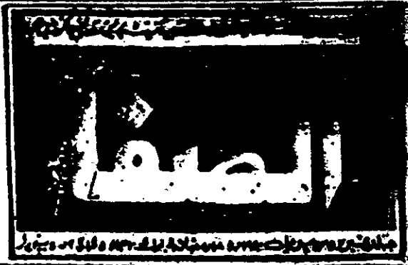
Press release of Hazbul Mujahideen faction of Kashmiri terrorists published in the morning edition of Urdu daily Aftab on 1/4/1990. Aftab is published from Srinagar. The headlines proclaimed: "The aim of present struggle is the supremacy of Islam in Kashmir, in all walks of life and nothing else. Anyone who puts any hurdle in our way will be annihilated."

کاشمیری پندتوں کو دو دنوں میں وادی سے ہٹانے کا مطالبہ کاشمیری پندتوں کو دو دنوں میں وادی سے ہٹانے کا مطالبہ